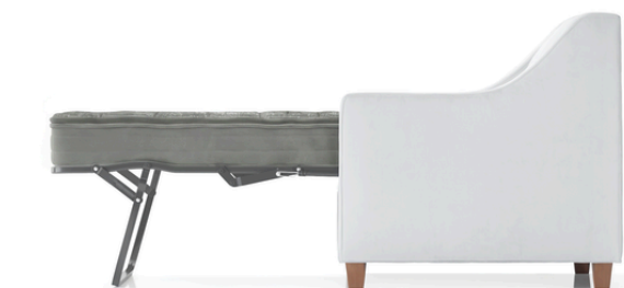
Sleep Between the Arms

While Zen Elite™ offers a traditional pullout with a familiar layout, Sleep Between the Arms delivers the same queen-level comfort in a smarter, space-saving design. Both options are thoughtfully engineered to adapt to today's environments—whether the priority is familiarity or maximizing available space.