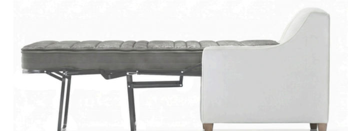
Traditional Queen Sleeper